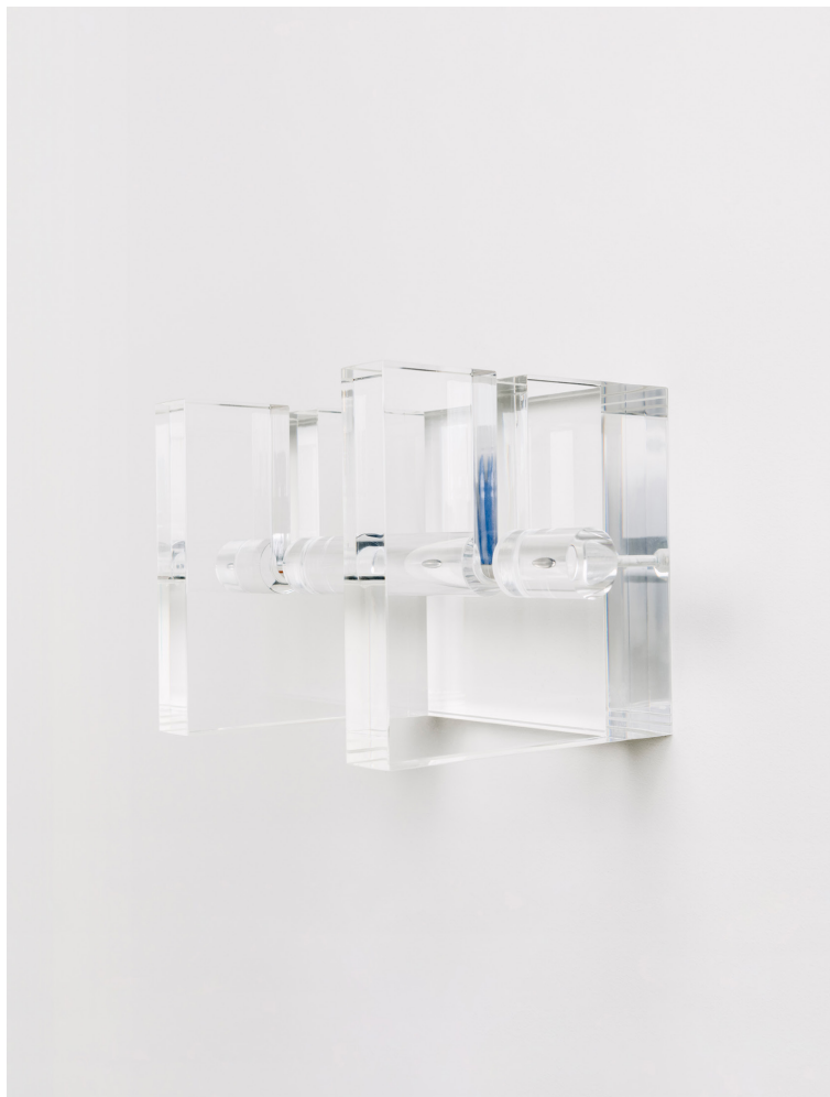
Untitled, 2020 Edition of Six Acrylic 12.0 W × 7.5 D × 7.0 H in. 304.8 W × 190.5 D × 177.8 H mm $480